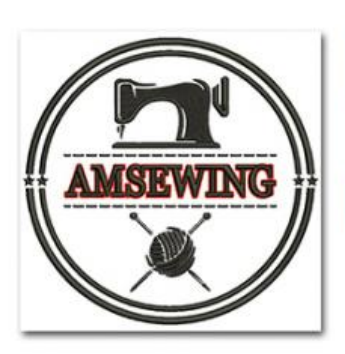
10 years OEM experience

Suppier of Walmart very low MOQ to start your Brand.