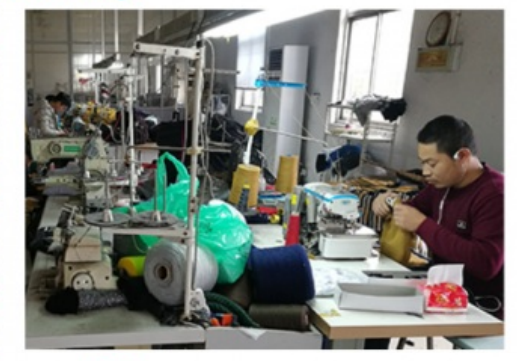
QC & packing workshop