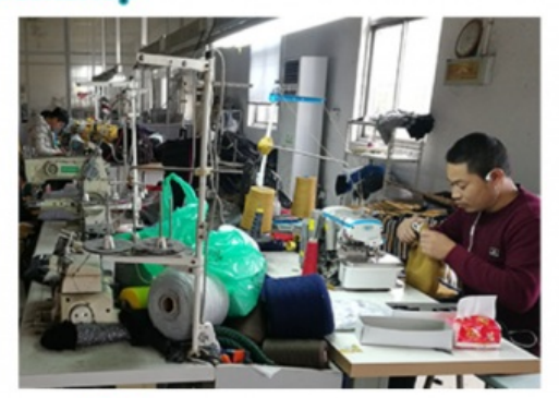
QC & packing workshop