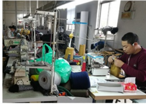
QC & packing workshop