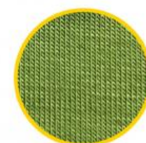
15. Bamboo Fiber