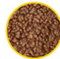
9. Faux Fur