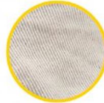
6. Organic Cotton