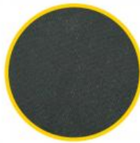
2. Cotton Twill