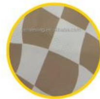
8. Recycled Fabric