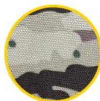
13. Camo Fabric