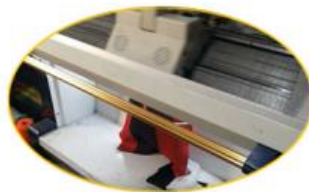
4. WEAVING ON THE MACHINE