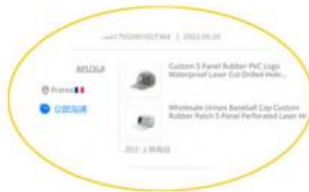
1. MAKE ORDER ON ALIBABA