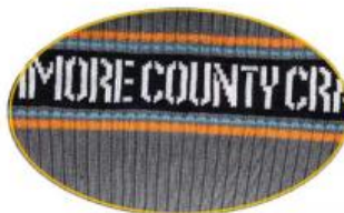
5. SEW PRODUCT