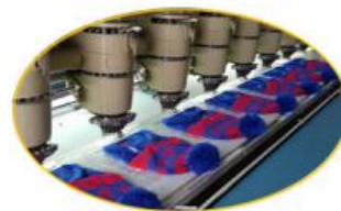
6. EMBROIDERY ON MACHINE