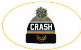
2. GET YOUR DESIGN