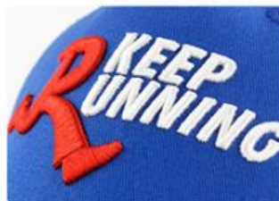
3D puff embroidery