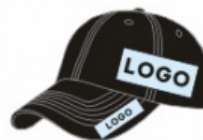
ON THE BRIM FRONT AND SIDE PANEL CROSS THE SEAM