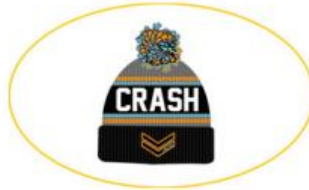
2. GET YOUR DESIGN