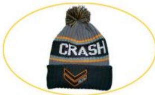
7. FINISHED PRODUCT