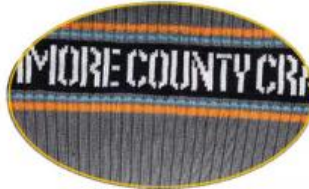
5. SEW PRODUCT