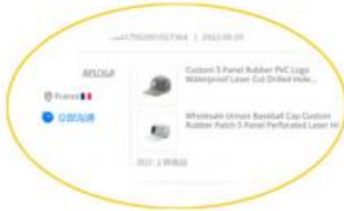
1. MAKE ORDER ON ALIBABA