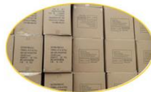
9. FINAL PACKING BY CARTON