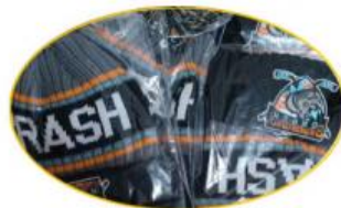
8. PACKING THE BEANIES