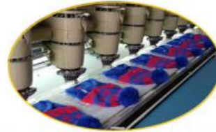
6. EMBROIDERY ON MACHINE