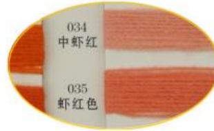
3. CHOOSE THE COLOR