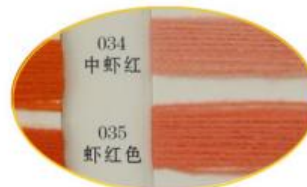
3. CHOOSE THE COLOR