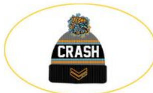
2. GET YOUR DESIGN