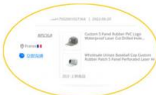
1. MAKE ORDER ON ALIBABA