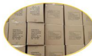
9. FINAL PACKING BY CARTON