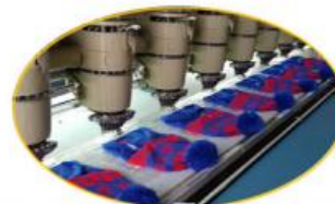
6. EMBROIDERY ON MACHINE