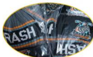
8. PACKING THE BEANIES