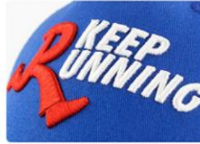
3D puff embroidery