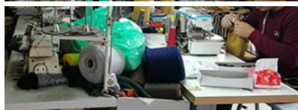
QC & packing workshop