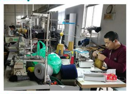
QC & packing workshop