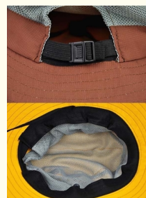
Adjustable Buckle Ponytail Hole