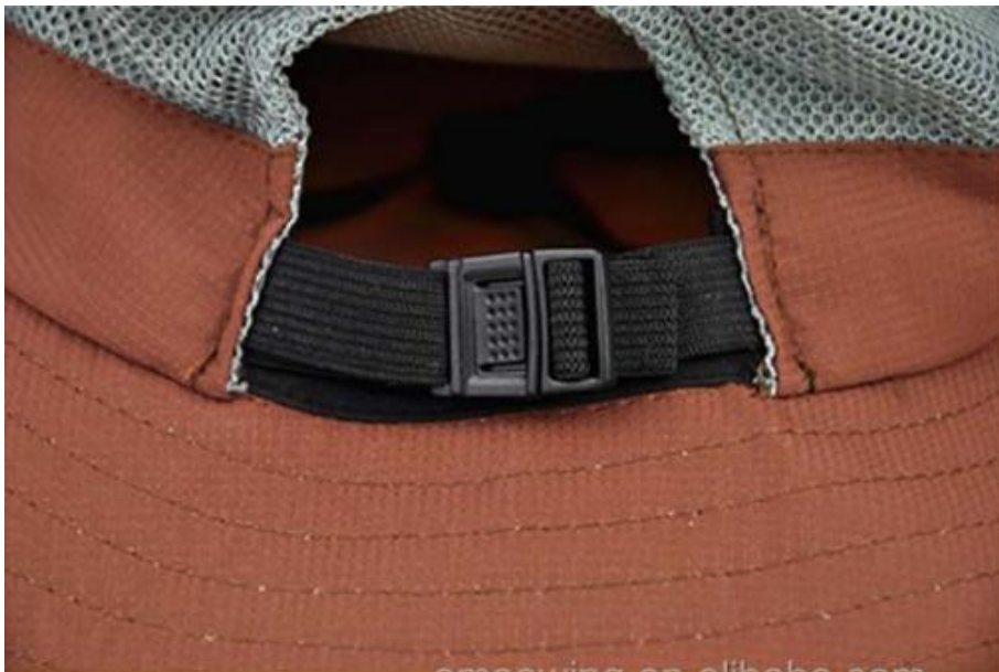
Adjustable Buckle Ponytail Hole