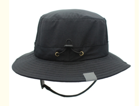
Image Style 2021 Sun Protection Hat, Unisex Fishing Hiking Surfing Hat