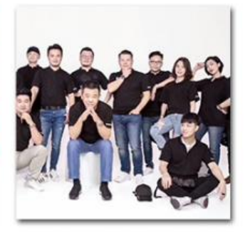
24-hour service we are a young strong Team full of energy and passion on the work.

Quality guarantee strict quality control system and quick feedback