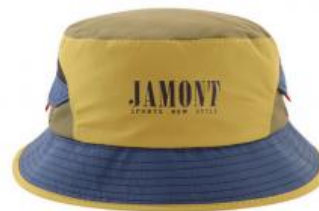
6. Printing Logo