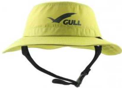
3. Surf style