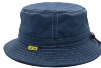
4. Woven Label