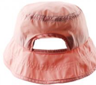
4. Ponytail style