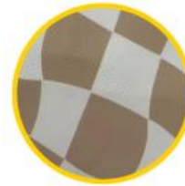
8. Recycled Fabric