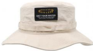
3. Woven Patch