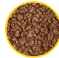
9. Faux Fur