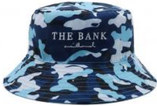
1. Casual style

choose the one that best fits your style and design!