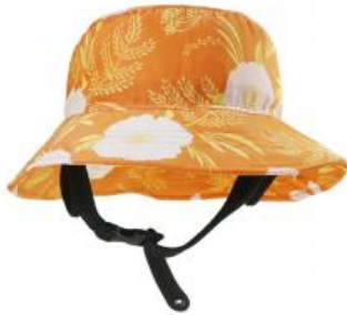
1. Full Printing Logo

we can custom the logos as your request!