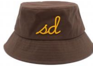
2. 3D Embroidery Logo