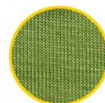
15. Bamboo Fiber