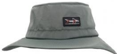
5. Rubber Patch