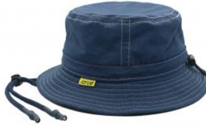
2. String style