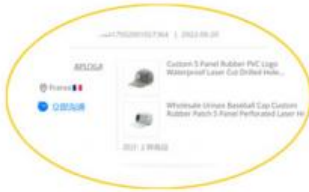
1. MAKE ORDER ON ALIBABA